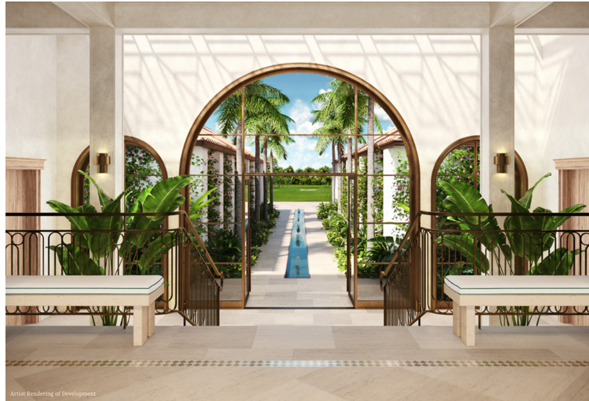
Artist Rendering of Development

Private marina featuring a boutique market and cocktail bar